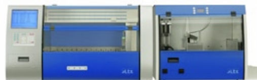
Stainer MAS in combination with Cover Slipper MCS