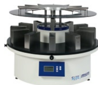
Stainer MSM for universal use