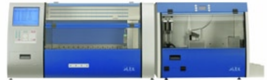
Stainer MAS in combination with Cover Slipper MCS