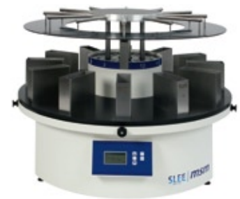
Stainer MSM for universal use